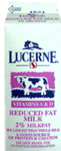
8 oz glass

Have ONLY these 3 items and get 233% of the recommended daily amount!!